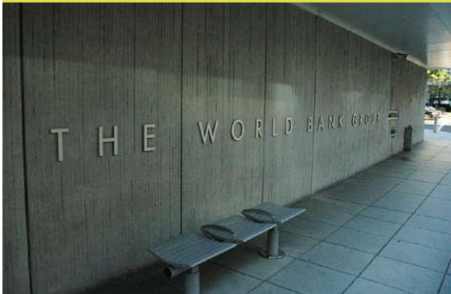
A recent World Bank policy paper criticized the concept of illegitimate debt.

ments are forced to cut expenditure required to meet basic human needs (the rights enshrined in the UN Charter and elsewhere, for basic education, health, water, shelter and food) in order to pay debt service. 27 Under international law states have a duty to protect, a duty to respect and a duty to fulfill. In the context of socio-economic rights, the duty to respect prevents a state from interfering with a social right that is already being enjoyed by the right's holder, the duty to protect requires that a state prevents third parties from interfering with social rights held by others, and the most far-reaching duty is the duty to fulfill, as it imposes on a state an obligation 'to take appropriate legislative, administrative, budgetary, judicial and other measures towards the full realization of such rights.' 28