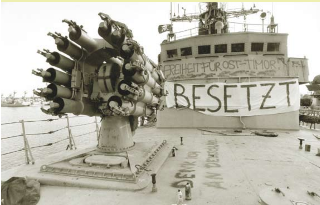
The occupation of the GDR warships in the port of Peenemünde shows that the risks of the deal were known when the contract was made.

fence agreed in a unpublished agreement: "The buyer commits himself to apply the subject of the contract only for the purpose of the safeguarding of the coasts and the seaways and for combating smuggling." This agreement has since been broken by the Indonesians. Under the presidency of Habibie, Wahid and Megawati Sukarnoputri the ships were deployed in all interior conflicts (massacre in East Timor in the summer of 1999, 7 naval blockade of the Moluccas in January 2000, 8 transportation of troops to the embattled province of Papua on 14 March, 2000, 9 transportation of troops and tanks to the war-torn province of Aceh on 21 May 2003 10 ). It is estimated that between 1993 and 1998 less than two thirds of the outstanding debt claims from the sale of the GDR ships were paid by Indonesia to Germany. Since then Indonesia's entire debt has been restructured several times. At the end of 2008 it was estimated that Indonesia had to pay at least EUR 100 million to Germany from the original debt claims in the sale of the GDR ships 11