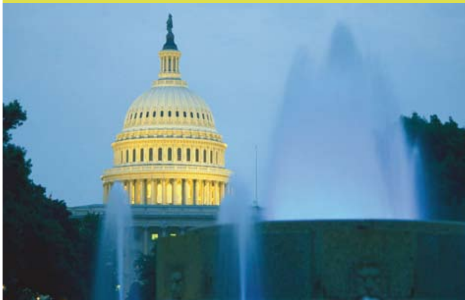
The Capitol, Washington D.C., where Congress debated the Jubilee Act for Responsible Lending and Expanded Debt Cancellation in 2009. The Senate failed to pass the Act, but it was re-introduced and may pass in early 2010.

be met primarily through grants rather than new lending. Policies should also be developed and promoted to ensure that all creditors work together to preserve the gains of debt relief. This is especially important as there is no bankruptcy law protecting countries against free-riders or predatory companies (known as vulture funds). These companies buy poor countries' international debt obligations at a deeply discounted rate and then seek to recover the original market value through legal or other processes.