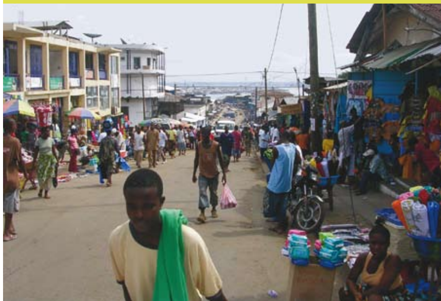
Street scene in Monrovia, Liberia.

In making this insurance available, EKN still needed to be certain that the political risk posed by Liberia was such that it would not amount to any potential default in respect of the loan repay-