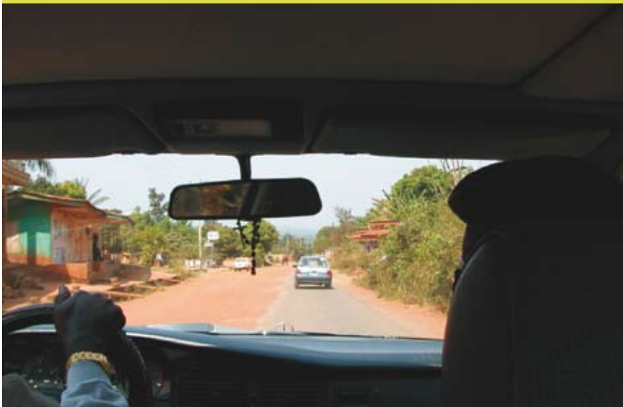
Enugu, Nigeria in December 2002. A typical result of large-scale corruption in public procurement: Only one lane of the road has been tarred.

An example of a case in which this doctrine became relevant is that of Adler v. Nigeria . 19 In that case, a U.S. businessman had been approached by various Nigerian individuals, including at least one government official, to participate in a fraudulent scheme of over-invoiced government contracts that would allow them to convert Nigerian government funds for their personal use. In return for taking part in some activities, including the provision of pro-forma invoices, Adler was promised a share in the profits of the scheme of about 60 million dollars. Adler made payments of about 5 million dollars, more than 2 million of which was used to bribe government officials, upon being told that in return the 60 million dollars would be deposited in his bank account. 20 However, he never received the promised money and the scheme instead turned out to be a scam. When Adler realised this, he sued the Nigerian state and a government official who had participated in the scheme,