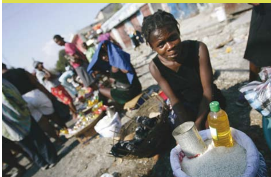
Woman selling rice in Port-au-Prince, Haiti.

tracted with the World Bank is odious. Because World Bank officials were often well aware of the end-uses of their loans, subjective awareness of odious lending may be relatively easy to establish. World Bank officials have, in recent years, essentially confessed that much of the post-war lending was odious. 31 This case, however, seems more difficult to make regarding IMF loans. 32