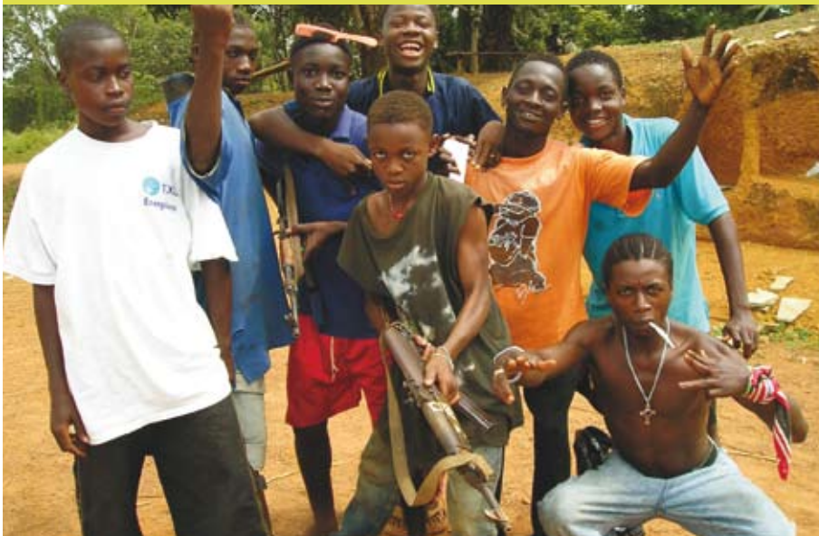
Child soldiers in Liberia.

man rights issue. The developed (mainly creditor) countries have consistently opposed consideration of the impact of foreign debt on the realisation of human rights by the UN human rights bodies, arguing that these bodies are not the appropriate ones to address the debt problem. However, in terms of article 22 of the International Covenant on Economic, Social and Cultural Rights, the Economic and Social Council (ECOSOC)