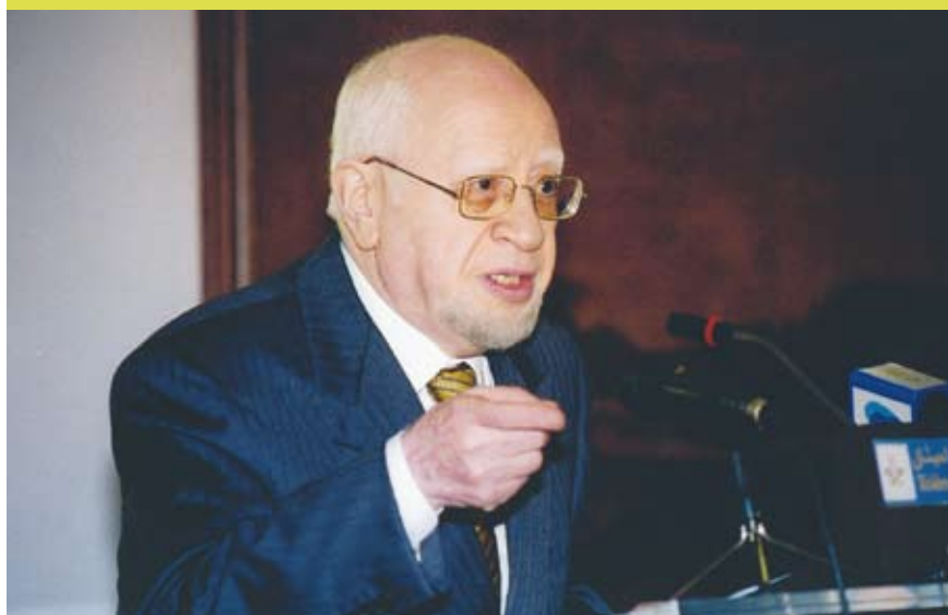
Dr. Mohammed Bedjaoui developed the concept of odious debt further and, apart from holding many other institutional mandates, was United Nations Legal Expert at the Conference of Plenipotentiaries in Vienna on the Convention on Succession of States in Respect of State Property, Archives and Debts in 1983.

The current consensus on norms which form part of ius cogens includes the outlawing of genocide, 36 slavery, 37 torture, 38 apartheid 39 and other crimes against humanity, 40 the use of force, 41 and the protection of the right to self-determination. 42 There exists, thus, agreement on a minimum catalogue of ius cogens norms. 43 More and more, it is suggested that protection of all fundamental human rights forms part of ius cogens . 44 This is, however, still controversial. 45 While Article 53 of the Vienna