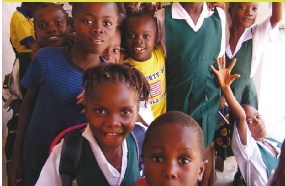
School class in Monrovia.

ment. This, in turn, would have depended on the type of information available to EKN on the political situation in Liberia to make that assessment. The presence of inconsistent information amongst Karlskronavarvet, PK-Banken and EKN was likely to affect the probability of a default on the part of Liberia. In anticipating such an eventuality, the question is whether any one of the three parties was in a better position to know of the political and economic risk in Liberia? Of the three parties, certainly EKN stood in a better position than either of the other two. The reason being that EKN was essentially set up to assist the Swedish Government with securing financial solutions for exports for Swedish products, i.e. Sweden's shipping industry exporting its way out of its decline with the support of EKN. With the kind of public information available on Liberia being what it was, EKN should certainly have foreseen that the political and economic risks faced by Liberia may have had implications for its ability to honour its payments under the loan agreement with BK-Banken. Yet, despite that, it proceeded to provide a guarantee to PK-Banken for the loan to Liberia, which, under normal due diligence considerations, may have raised serious questions with regard to its viability.