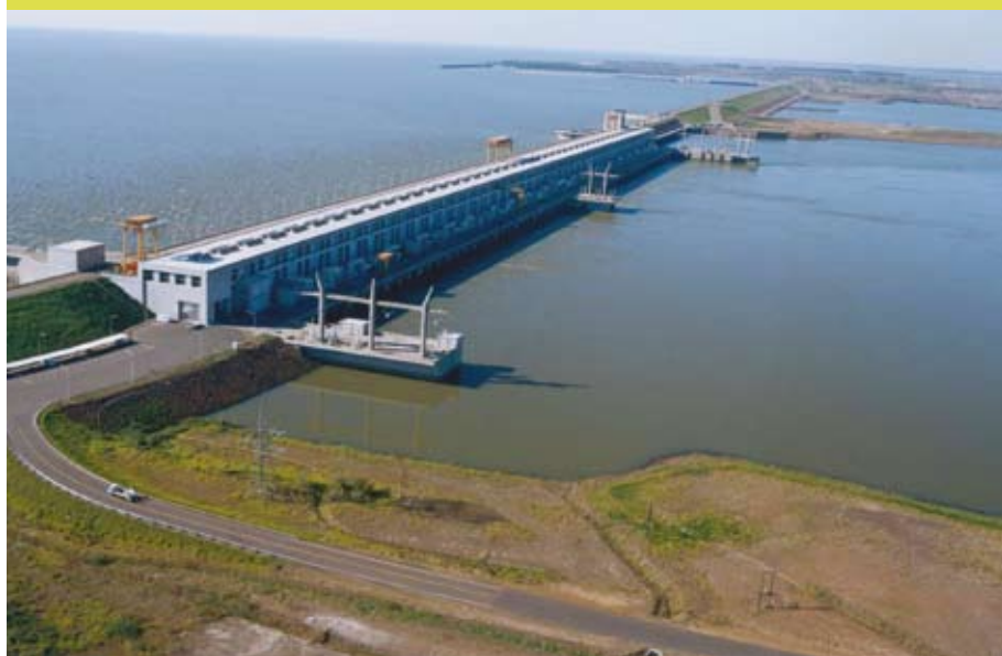
The Yacyretá Hydroelectric Dam at the Paraná River, which runs along the Argentine-Paraguayan border.

tional costs and treaty surcharges, thus excluding the costs of the original debt.