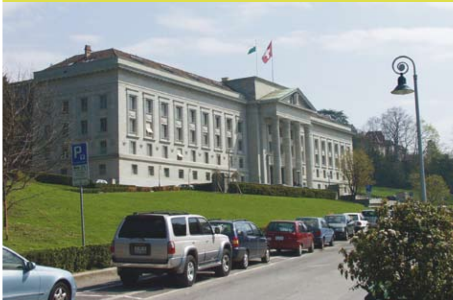
The Swiss Federal Court

was not bound by the agreements signed by Gramont Berres as he had not been duly authorised to bind the state. When the banks initiated proceedings in Swiss courts against Paraguay, the Government of Paraguay argued that Swiss courts did not have jurisdiction in Paraguay. The main issues before the Swiss courts were thus the validity of the guarantees issued by Gramont Berres in the name of the Republic of Paraguay, and whether Swiss courts had jurisdiction over the matter.