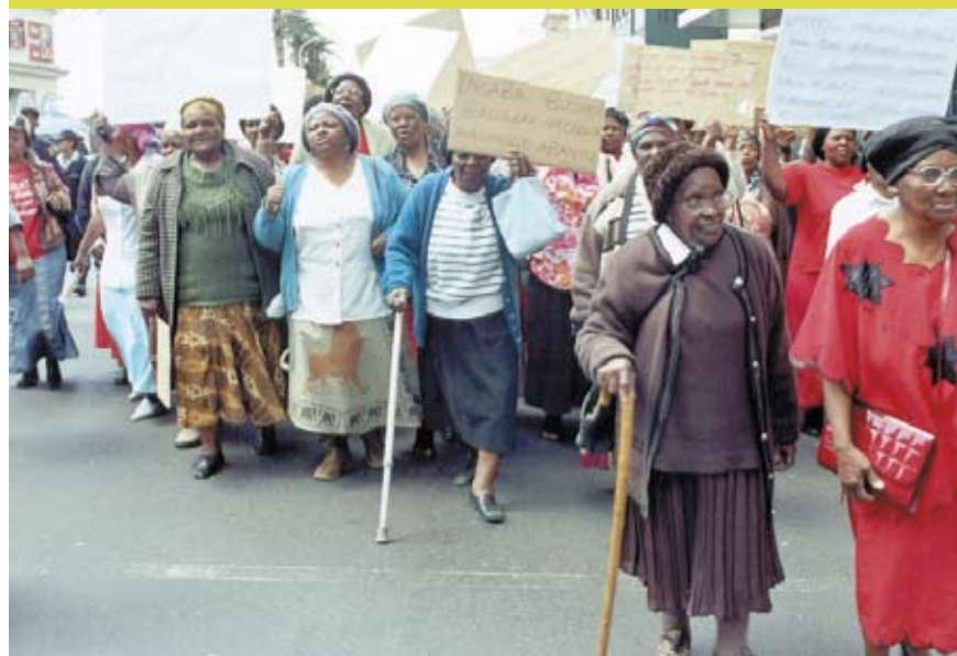
Victims of apartheid united in the "Khulumani Support Group for Survivors of Violence and Torture" march to Parliament in Kapstadt on 28 th November 2005.

In addition to tying the concept of 'illegitimate debt' to equitable principles, some 26 have gone one step further to make a connection between 'illegitimate debt' and its impact on socio-economic rights. The New Economics Foundation argues that it is a violation of human rights if govern-