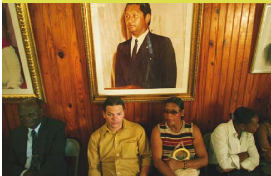
The Duvalier Foundation in Port-au-Prince, Haiti on 14 th April 2007. As a rule, former dictatorial clans can preserve their political and economic influence beyond regime changes.