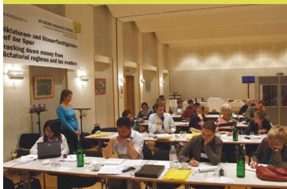
International Conference on Illegitimate Debt in Berne, Switzerland on 3 rd –4 th October 2007.