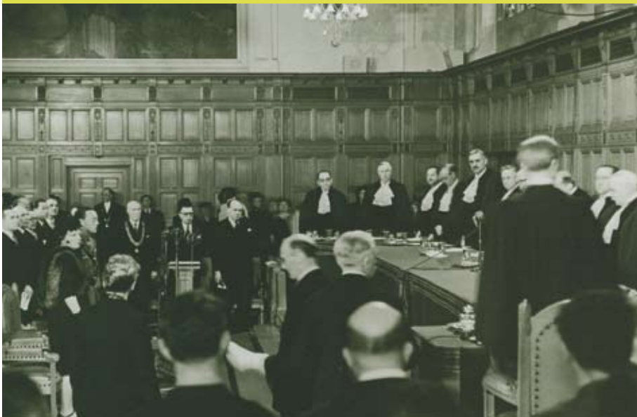
Inaugural session of the International Court of Justice at the Peace Palace in The Hague on 18 th April 1946 in the presence of Her Royal Highness Princess Juliana of the Netherlands.

Convention only applies to treaties between states, it is widely recognised that ius cogens norms are universally applicable 46 and that the obligation not to violate ius cogens norms is thus not limited to violations that occur in the context of such treaties and instead applies to all state acts. 47 States can accordingly not contract out of the obligation to comply with ius cogens by entering into private contracts that are in conflict with ius cogens norms, 48 and debt agreements that violate ius cogens norms could consequently be void. 49